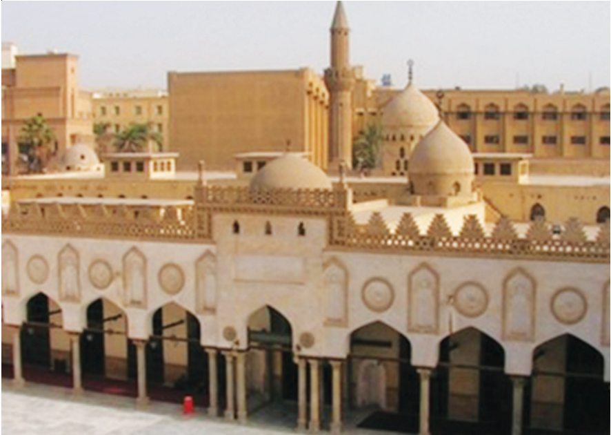
The Al-Azhar Mosque and University are a grand structure that reflects many centuries of styles

Al-Azhar University in Cairo Egypt is one of the oldest operating universities in the world. The Islamic university is connected to the beautiful and historic Al-Azhar Mosque.