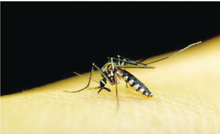
Belize City, Central Health Region has been very proactive in health education and cleanup campaigns.

The Ministry of Health in Belize, in its latest vector control program report, cited citizen engagement as a major challenge in combating the spread of vector borne diseases.