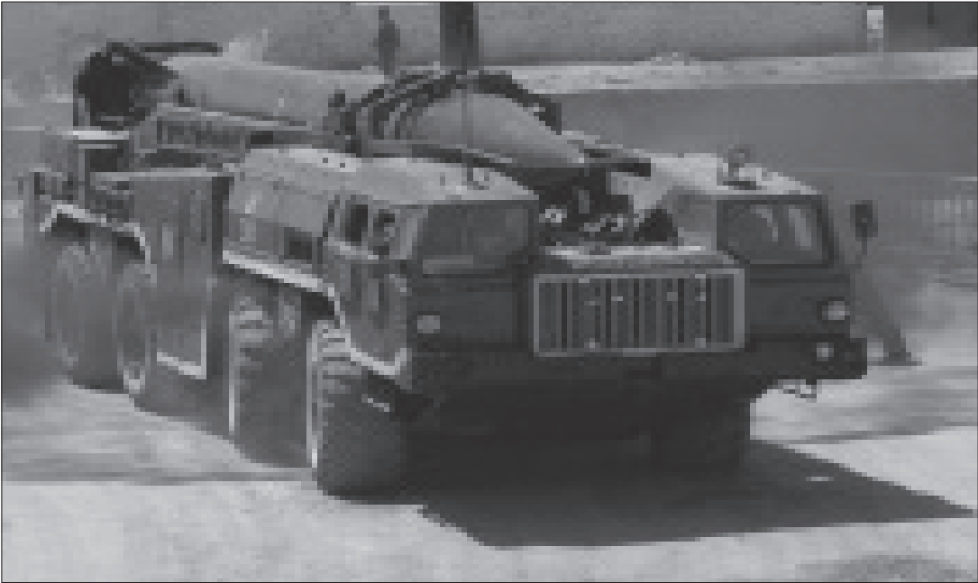
Houthi Scud Missile

Veterans Today Magazine online reporting of Israeli planes with SA markings field testing some nuclear bunker busters went all over the Arab Press, the Western media had a complete black out, as usual. But the paradigm has changed because of this huge blunder. Anyone and everyone will be looking to make or buy these weapons, which do not need sophisticated nuclear warhead material, as not only a deterrent, but one which would be used offensively. Countries in the region are not going accept their being designated as testing grounds. The UN and IAEA, by hiding this story, have marginalized themselves even more so now as being very selective in their non-proliferation concerns... Jim W. Dean ] “The Saudi residents of Khamees al-Mushait are waiting in a several-kilometer-long trail of cars to flee after their city was hit by Yemeni Scud missiles,” the Arabic-language Sa’ada Press news website reported. The Riyadh-based Ahrar al-Hejaz news website also reported that many Saudi princes have fled to western countries, specially France and Britain, after consecutive defeats of King Salman’s army and plots, adding that some other princes are running away in anticipation of trial and punishment due to their opposition to the king’s war on Yemen. Earlier today, a high-ranking Yemeni official underlined that firing missiles by Yemen