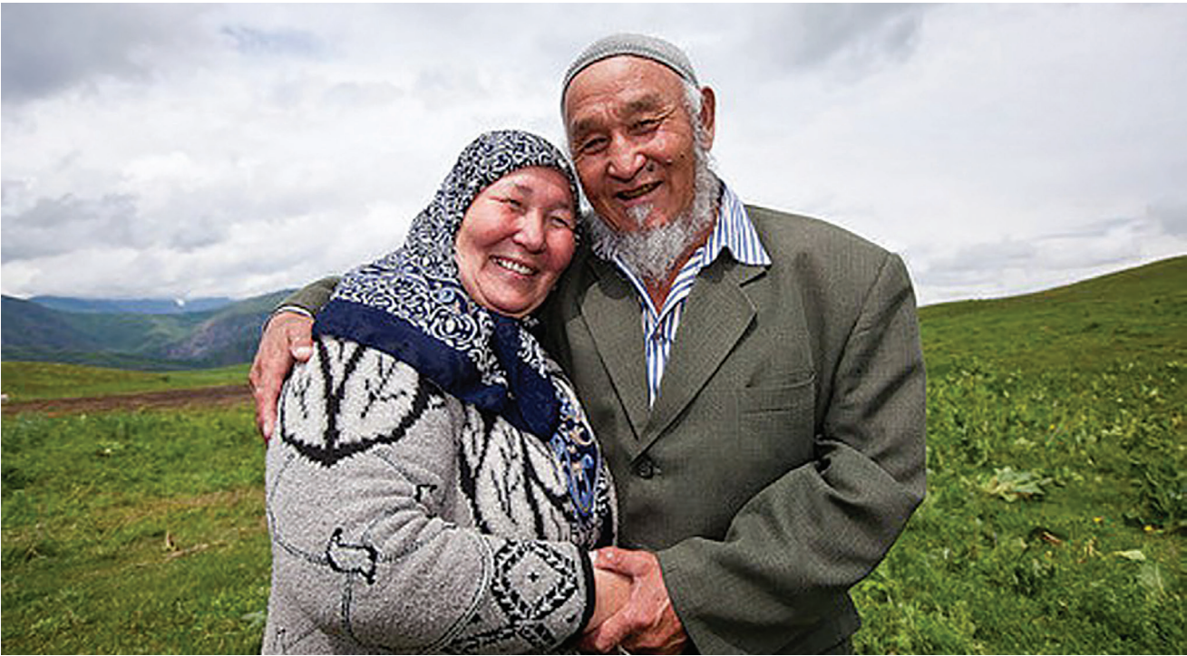
One hundred years ago, the life expectancy for men was 48 and for women 52. Today we outlive our ancestors because life isn’t as hard.

Many of us grow old before our time. The worries of this world overwhelm us. We are always aspiring for something worldly that is far reaching. It takes us away from our true focus - Allah Almighty. One hundred years ago, the life expectancy for men was 48 and for women 52. Today we outlive our ancestors because life isn't as hard. Years ago, people walked long distances, which of course kept them in shape. Today we walk very little. As our bodies change, so do our organs inside. Our heart rate becomes slightly slower, and our hearts may become bigger. Our blood vessels and arteries also become stiffer, which causes the heart to work harder. Often times, this leads to hypertension and other cardiovascular problems. What can we do to improve our aging and get the best quality of life as well?