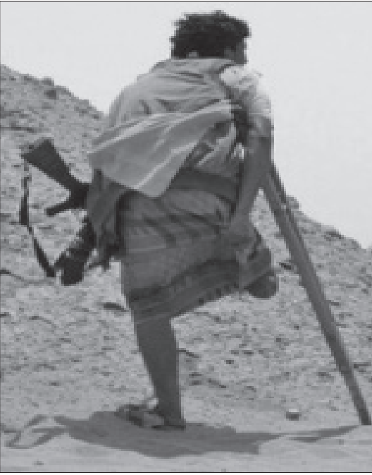
Yemeni amputee prepared to fight

extent of the Saudi casualties in the border areas. The attack came after Saudi warplanes pounded the areas of Bani Sayah and Sahar in Sa’ada province and claimed the lives of more than 70 civilians. The Yemeni sources confirmed that the missiles fired by the popular forces against the Saudi targets inflicted substantial losses on an arms depot and four military patrol vehicles, killing several Saudi forces. The missile attacks which were carried out in Towailaq district in the Saudi border region of Jizan was revealed by a military source to Yemen’s SABA news agency during an interview. “A large number of Saudi military aggression forces were killed in the attacks,” the source, who asked to remain unnamed, said. Saudi Arabia has been bombing Yemen in the last 74 days to bring its ally, fugitive president Mansour Hadi, back to power. The airstrikes have so far claimed the lives of more than 4,367 civilians, mostly women and children. According to a recent report by Freedom House Foundation, most of the victims of the deadly Al Saud campaign are civilians, including a large number of women and children.