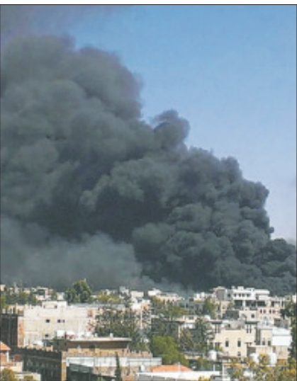
Smoke fills the sky above the Yemeni capital Sana’a after a series of airstrikes (12 May).

New York - The violent end of the ceasefire in Yemen saw human rights advocates decrying the recent continued use, by the U.S.-backed and Saudi-led coalition, of deadly cluster bomb munitions. Cluster munitions, which are banned by much of the world by the international Convention on Cluster Bomb Munitions, are considered imprecise weapons that are made specifically to kill people and spread destruction over a wide area, posing a long-term danger to civilians because of the unexploded bomblets they leave behind. The treaty is not recognized by the U.S., Saudi Arabia or Yemen. A meeting was held on May 17 in Saudi Arabia, attended by Yemeni officials, as well as tribal leaders, in an effort to discuss the future of the country and hammer out details that could possibly lead to a more lasting ceasefire. However, the Houthis refused to attend the three day meeting as it was held in Saudi Arabia, they stated, and that the main objective of the talks was to discuss the reinstatement of former President Abed Rabbo Mansour Hadi. Hadi was forced to step down as president of Yemen in an apparent takeover by military loyalists of former president dictator Ali Abdullah Saleh, and Houthi rebels who have numerous complaints against the government. The 5 day truce saw aid workers rushing to distribute the food, water, medical supplies and other items in short supply due to a Saudi naval, land and air blockade. Power outages and