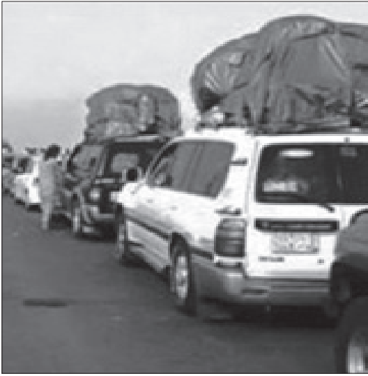
Saudis now begin to join the Yemenis who are refugees – This is the only Google photo showing the exodus