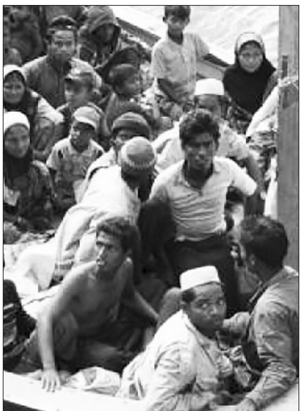
Rohingya Muslims, driven by desperation, flee poverty and persecution in Burma.

(RNS) Hundreds of thousands of Rohingya Muslims live in squalor in Myanmar’s western Rakhine State; thousands [are] fleeing by land and sea in search of better lives and basic survival.