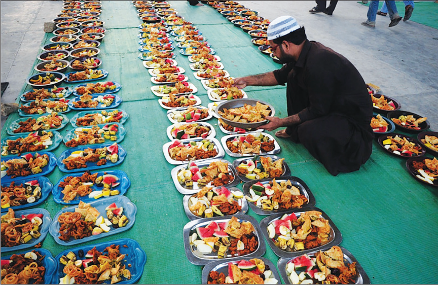
Ramadhan brings nearness to Allah Almighty through taqwa (piety and righteousness), resulting in forgiveness of sins and attainment of His blessings.

also not sleep through this time. If one does not have enough time to eat food to fill its need, it can take help from just drinking water, as the Messenger