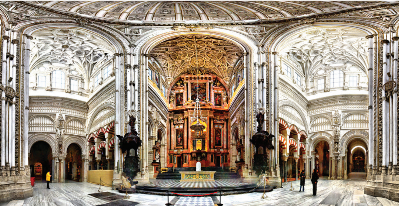
An Exquisite Mosque. "Brethren, we have assembled here to search faith and it is a very auspicious task."

Since previous Messengers and their revealed Books were for particular periods and particular people, so they did not contain laws which were needed by men till the last day. The gap was filled by the Quran and, after completing the code of religion, proclaimed that needs