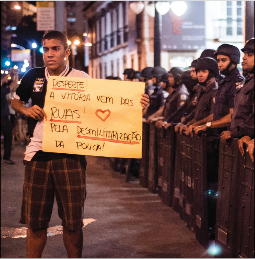
The increase of police forces and military-type policing, with no regard for the lives of people of color and the poor, is representative of the despot aspirations and planning of a small group of individuals.