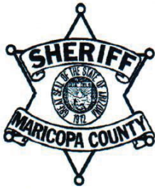
Joseph M. Arpaio, Sheriff