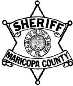
Joseph M. Arpaio, Sheriff